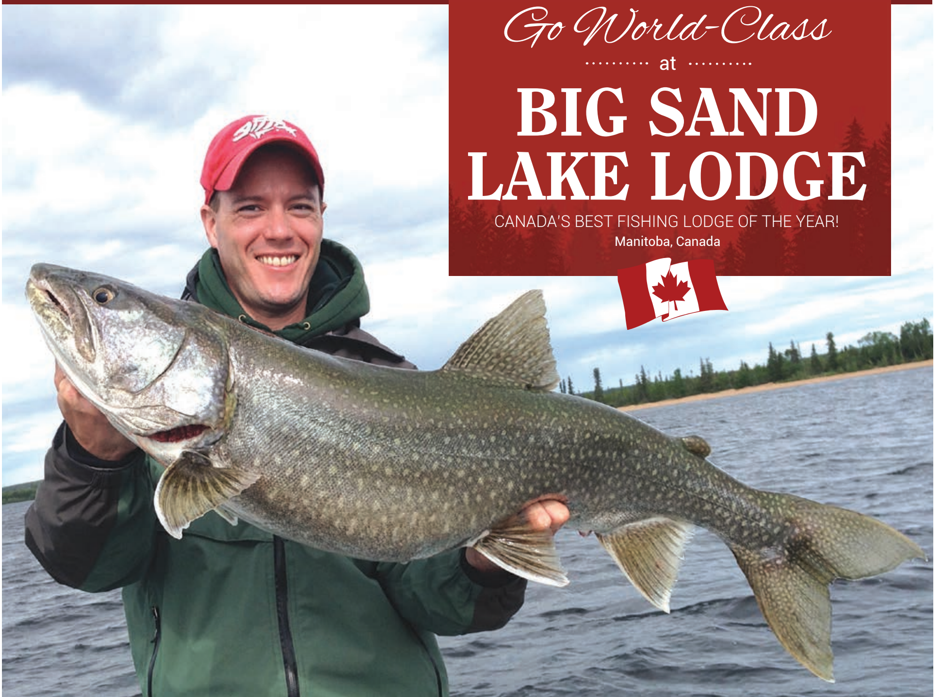
46" LAKE TROUT